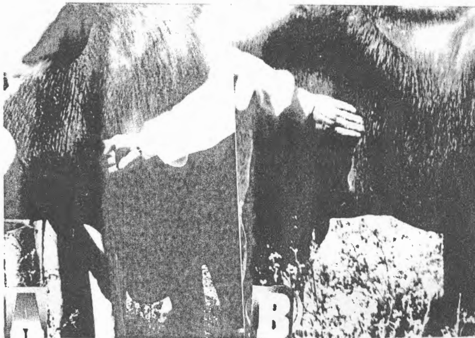
Fig. 2. A : Buffalo: enlarged prescapular lymph node. B: Buffalo: enlarged prefemoral lymph node.