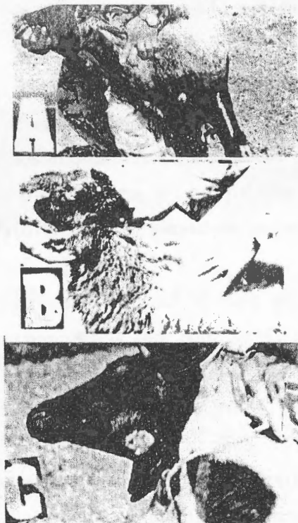
Fig.4: A. Ewe: enlarged parotid, retropharyngeal and opened prescapular lymph nodes. B: Ewe; enlarged right parapharyngeal lymph node. C. Ewe : opened submandibular lymph node and yield caseated pus.