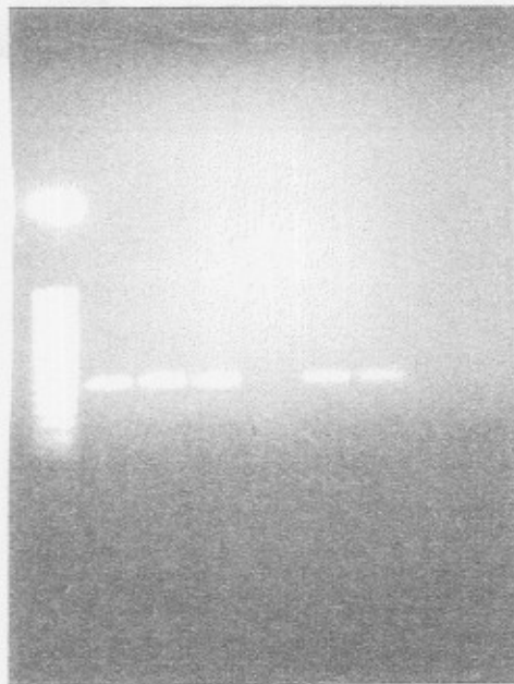
Fig. 2: Agarose gel (1%) analysis of RT-PCR amplified products of 5 UTR viral RNA: M is 50 bp DNA ladder (Promega, Cat. No. G 4521). Lane 1 is a positive control, lanes 2, 3, 5 and 6 are some represented positive samples, lane 4 is represented a negative sample and lane 7 is a negative control.