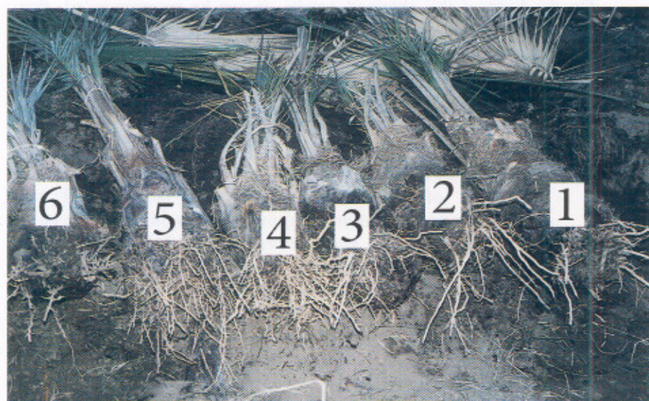
1. Halawy 2. Bent Aisha 3. Orabi 4. Hayany 5. Zaghloul 6. Sammany