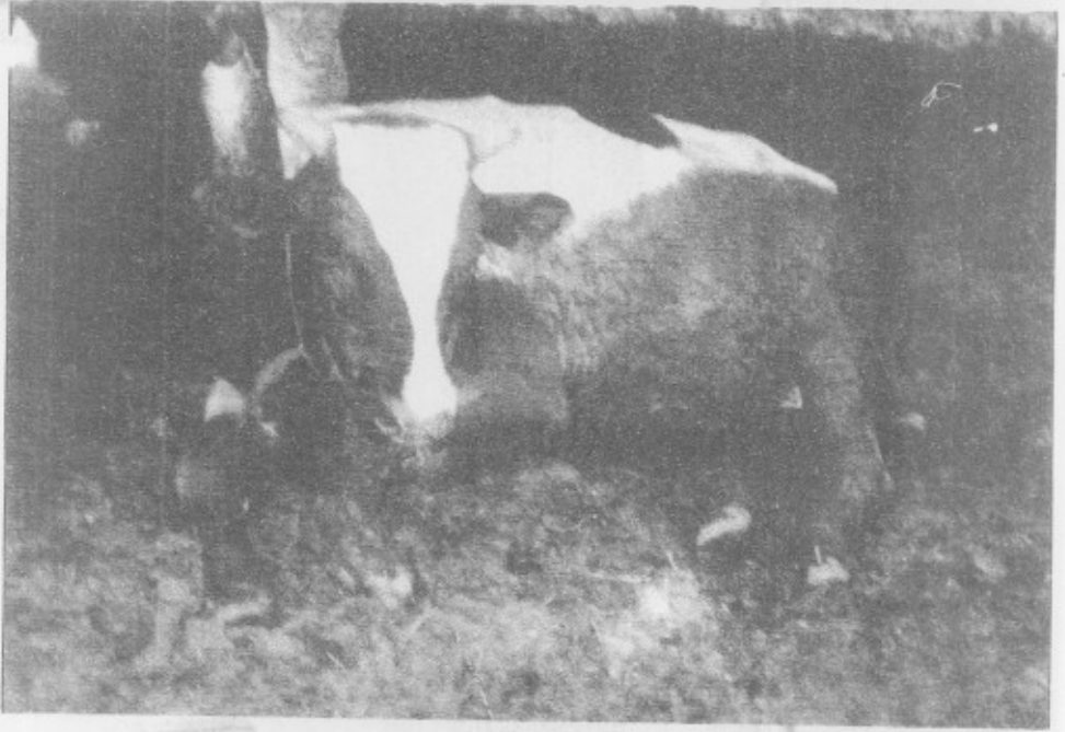
Fig. 3: Animal showing depression and sternum recumbency with head directed to flank region