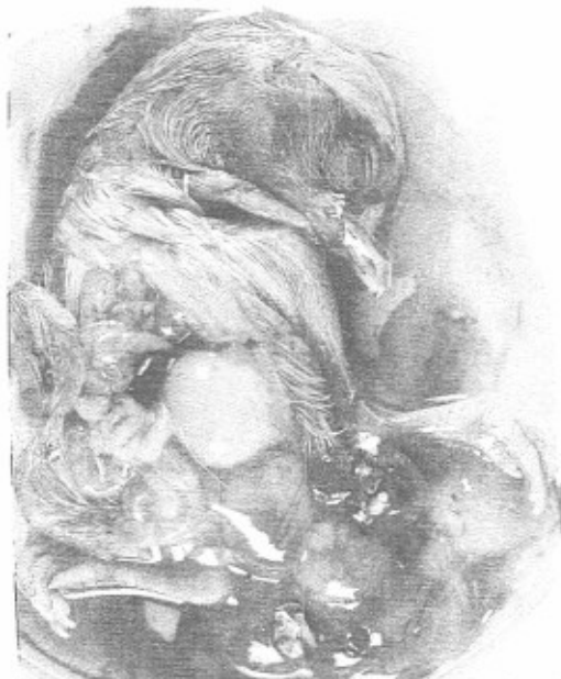
Fig. 1 : Listeria infected chicken embryo at 13/14 days showing severe congestion of internal organs, distention of gall bladder, enlargement and congestion of yolk sac.