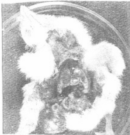
Fig. 4: Experimental and contact chicks showing sever congestion in all body muscles and internal organs.