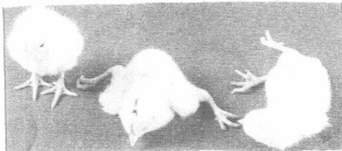
Fig. 3 : Hatched chicks expressing bilateral toe paralysis and Tremor ( Right, Middle)- uninfected chick (Left).