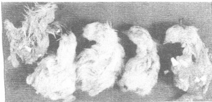
Fig. 2 : Inoculated chick that died at day 9 post-inoculation showing stunting, depression, ruffled feathers, incoordination of gait and prostration.