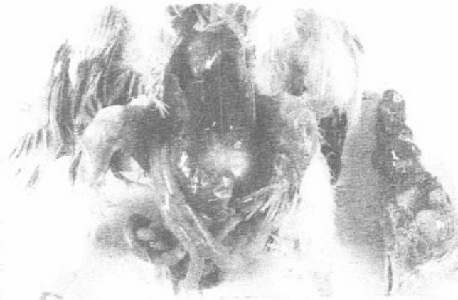
Fig. 7: Intraperitoneally inoculated ckickens showing congestion of internal organs, pericarditis, air sacculitis and brain.