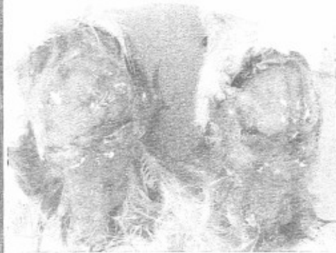
Fig. 5: Experimental and contact chicks showing congested brain and oedematous fluid on the meninges.