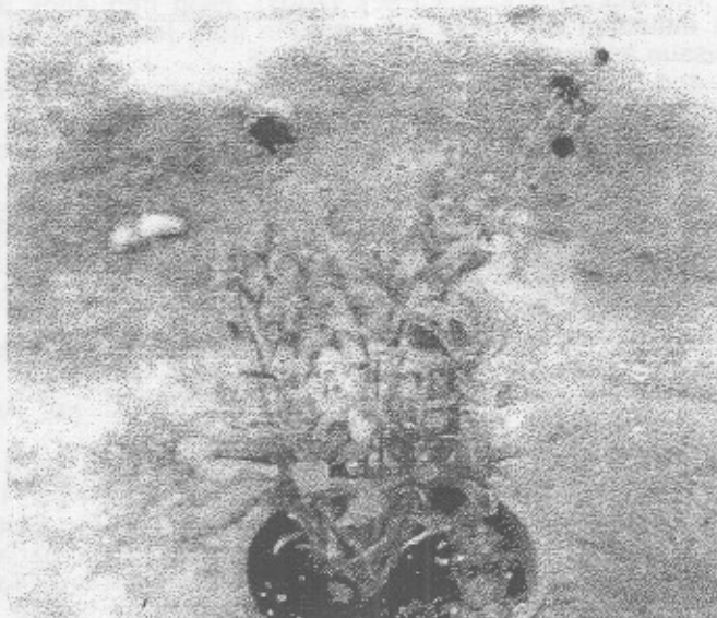
Fig (5): Flowering plant obtained from in vitro regeneration.

In conclusion, this study was developed as a protocol for rapid direct regeneration of Calendula officinalis from leaf and cotyledonary node explants. The efficiency of morphogenesis was dependent on growth regulators. Auxins (2,4-D or NAA) alone were essential to enhance shoot-bud regeneration from leaf culture, while BA was not effective in this concern. This protocol might be useful for genetic improvement programs of this plant.