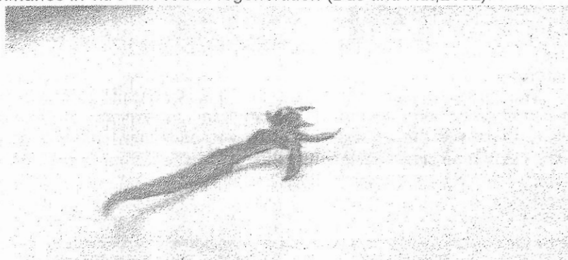
Fig(1) :Direct shoot proliferation from leaf cultured on MS medium supplemented with 1.0 mg/L 2,4-D.

The different responses could be due to the varying concentration of growth regulators used in the medium and explant type (Samantary et al. , 1995). There was certain regulators action of cytokinin, auxin and apical dominance in vitro shoot bud regeneration (Das and Rut,2002).