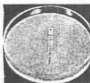
Fig. (1, 2, 3, 4 &amp; 5). Determination of minimum inhibitory concentrations (MIC) of imipenem (IPM) against different multidrug resistant strains using E-test