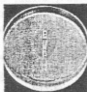
Fig. (3) E. coli