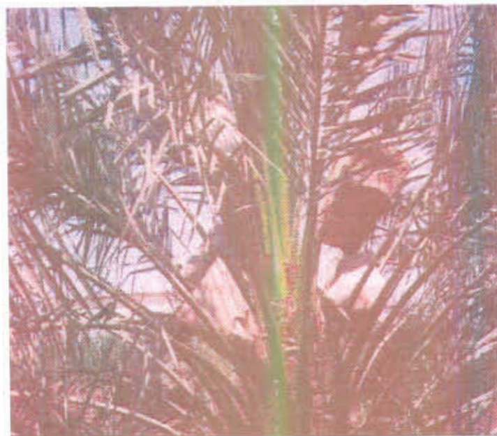
Plate 1. Female spathes of Barhi date palm cv. covered with perforated paper bags

samples from each treatment were picked at random. Each sample contained 25 fruits for the determination of fruit length titratable acidity % and tannins % were determined in the fruit flesh according to the A.O.A.C. methods (1980) .