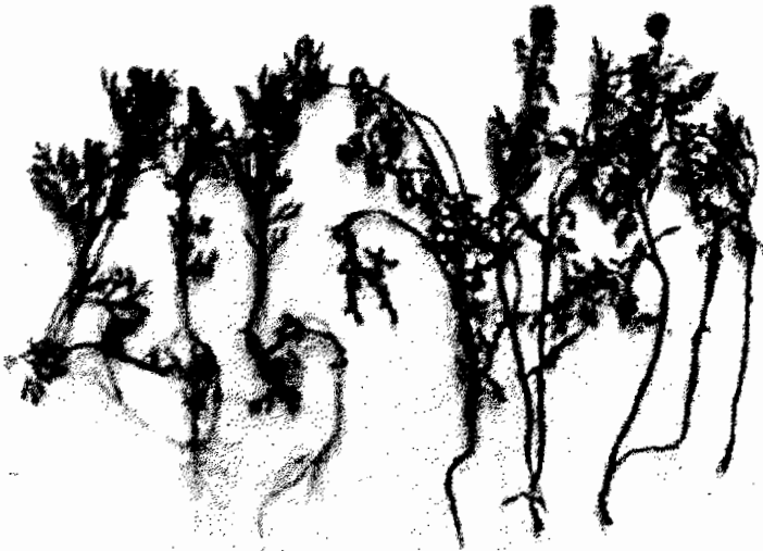
Fig.(6): Artificially wilted seedlings casued by F. Oxysporum (right), healthy seedlings ( left ).