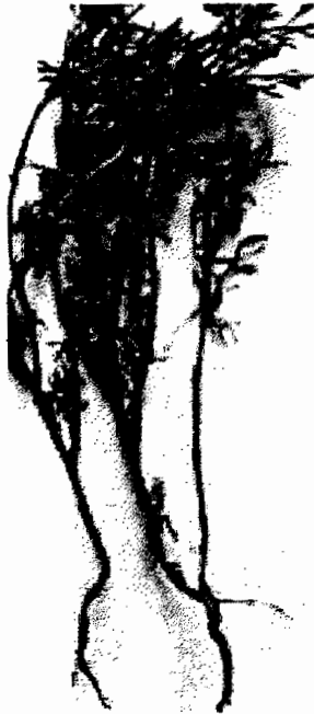
Fig.(2): Withered plants from the field , showing root rot and wilt symptoms.