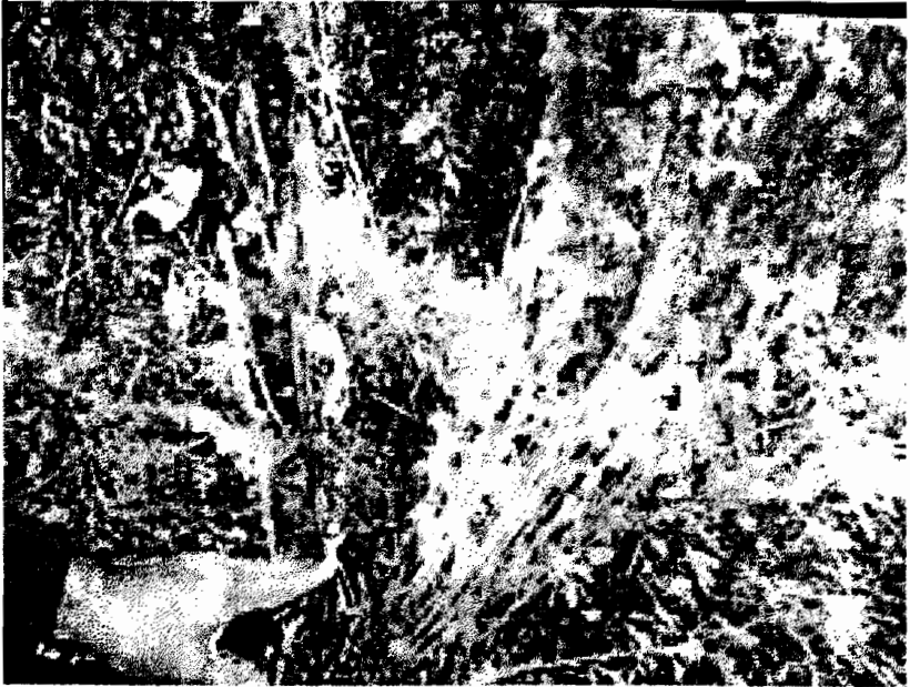
Fig.(1): Natural infection in the field showing symptoms of yellowing, and wilting on the foliar growth.