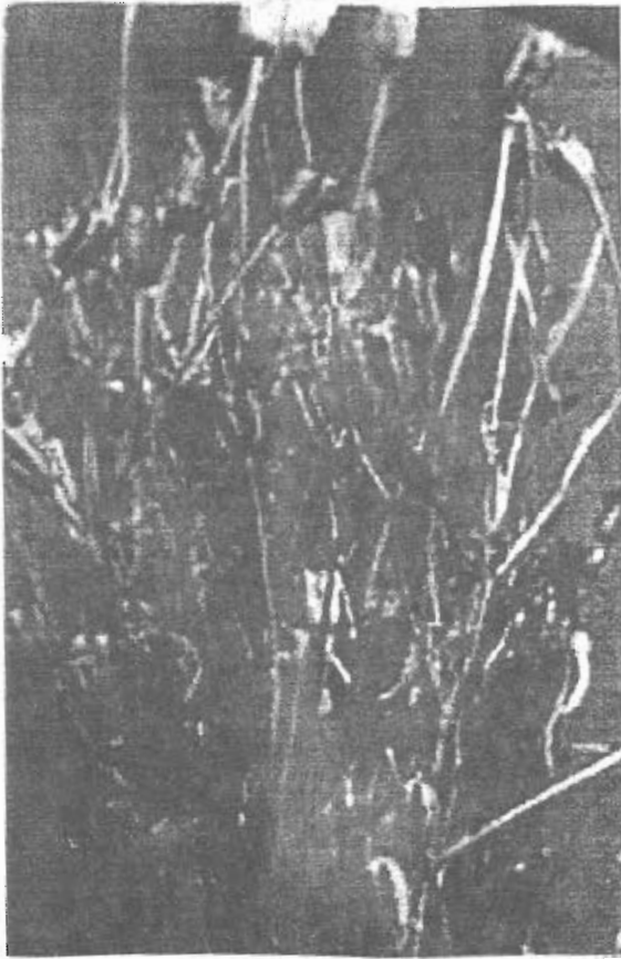
Fig.(3): Pod blight on N.satva immature plant caused by Alternari alternate , showing black and dry of the infected pods.