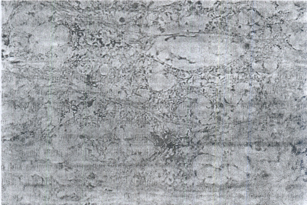
Fig. 2: Positive immunohistochemistry of medulla oblongata of sheep showed abnormal accumulation of PrP. X40