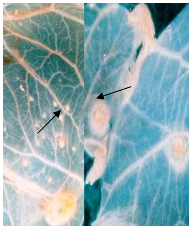
Fig. (1): Small and large pock lesions in infected CAM.