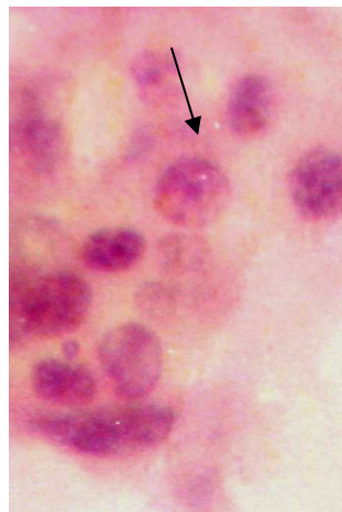
Fig.(2): Intranuclear inclusions in MDBK infected cells.