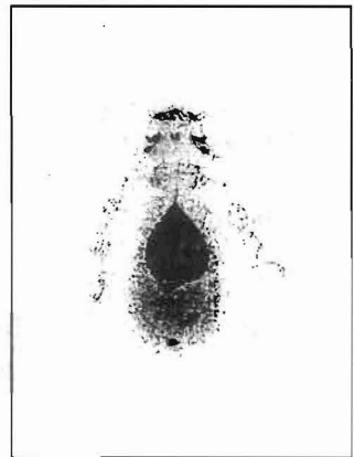
Fig (2): Photograph of nymph of biting lice, M. Cornutus