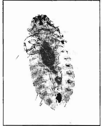
Fig (4): Photograph of Female adult of M. gallinae , (Dorsal view)