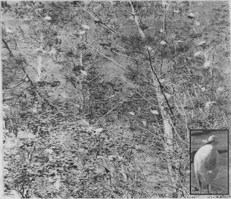
Fig. (1): Cattle egrets nesting on trees

Each bird was thoroughly examined by naked eye and by the aid of hand lens and bright light to look for lesions and for any ectoparasites. Ticks, mites and lice were counted by the aid of a binocular microscope. The collected ticks, mites and lice were placed in 70% alcohol containing 5% glycerin. Specimens were cleared in lactophenol, mounted and identified according to Baker et al (1956) , Baker and Wharton (1959) , Madbouly (1961) , Krantz (1970) , Guirgis (1971) , McDaniel (1979) and Manuel (1981) . Some of the recorded ectoparasites were photographed using Leica Wild MPS32 photo microscope.