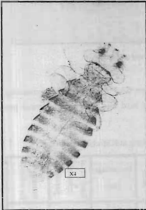
Fig. (2): Menacanthus stramenius

A total of 76 out of 81 (93.8%) examined cattle egrets were infected with ectoparasites. As shown in Table (1) a total of 76 out of 81 (93.8%) were infected with the lice, Menacanthus stramenius (Fig. 2), 23 out of 81 (24.4%) birds were infected with the red mite, Dermanyssus gallinae (Fig. 3) and 30 out of 81 (37%) birds were infected with the Argasid tick, Argas arboreus (Fig. 4).