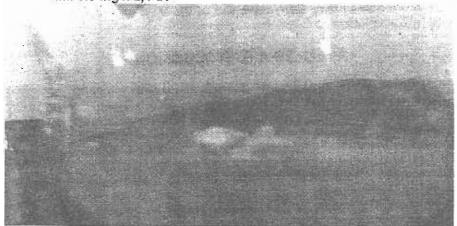
Fig.(2): Callus induction from the immature embryos of Gemmeiza 10 on medium containing 2 mg /l 2,4-D+ 0.5 mg /l kin. Initiated