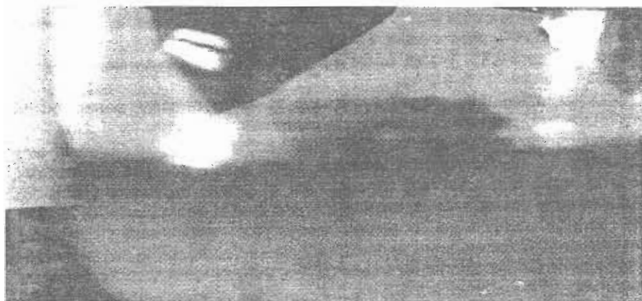
Fig.(1) .Callus induction from the immature embryos of Giza 168 with starting of plant regeneration on medium containing 1.0 mg /l kin. 0.5 mg /l 2,4-D.