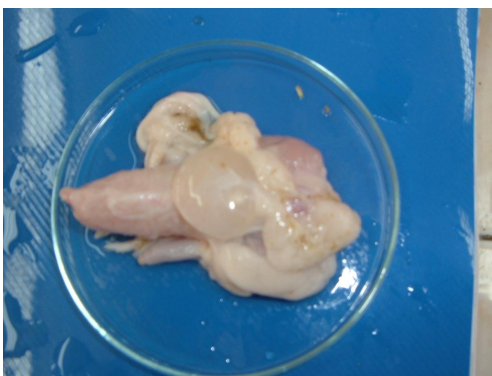
C. tenuicollis attached to bladder