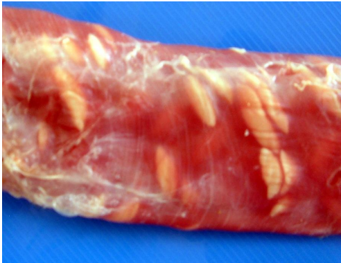
Sarcocystis spp. (cysts in esophagus)