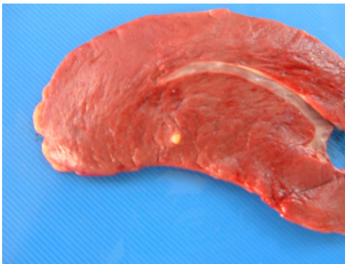
C.bovis in heart