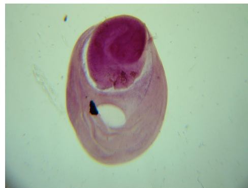
C.bovis (stained with Carmine )