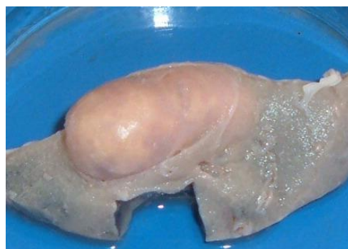
Hydatid cyst in lung tissue