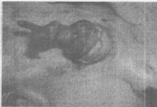
Figure 1- Photograph of the paraphimosed penis with necrosis of the os penis. Note the swollen bulbos glandis