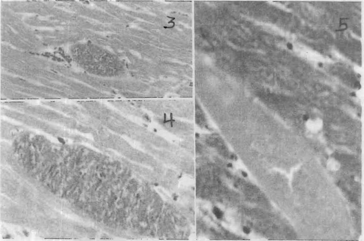
Plate 2: Morphological character and structure of Sarcocystis tenella and S. capracanis