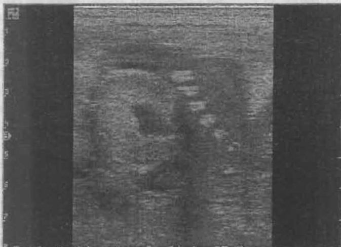
Fig 1a: Sonogram showing the placentome in pregnant ewe (80 days).