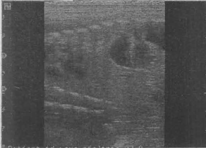
Fig 1b: Sonogram showing the chest in pregnant ewe (120 days).

The analysis was carried out according to SAS (1988). The effect of season was analyzed by ANOVA, while the effect of fetal sex was analyzed by t-test. Correlation models were fitted to evaluate the relationship between gestation age, lamb birth weight, and each of the studied parameters.