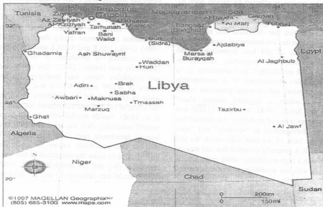
Figure 1. Aljabal Alkhdar region, north east Libya