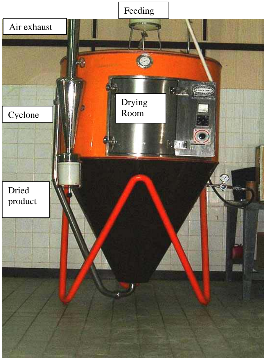
Figure 1a: Photograph of the lab-scale spray dryer.