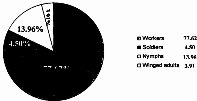
Fig. (2): Ratio of caste composition of P. hybostoma at El-Konooz region, Qena Governorate from January to December 2009.

The obtained data in Table (2) showed that the total number of workers and soldiers were 58238 individuals, The total number of soldiers were 3193 represented 57.82% of all individuals. These numbers were collected from 235 p.v.c. traps represented 247.82% individuals per trap. The number of individuals termite per trap in this study was higher than those recorded previously by Badawi et al. (1985) who found that, the ratios of 26.4% and 16.4% were recorded for Amitermes sp. While the lower ratio of 6.2% was recorded for Anacanthotermes sp. Ahmed (2008) showed that, the ratio of soldiers /1000 worker of P. hybostoma reached 14.20% and 13.47% in two regions.