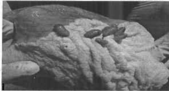
Figure 1: Gasterophilus larvae in the stomach of a non treated donkey