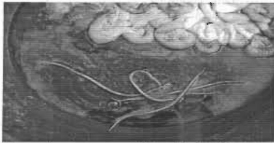
Figure 2: Parascaris equorum removed from intestine of a non treated donkey