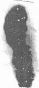
(Fig.7) pupae with complete blackening of the body leading to death.