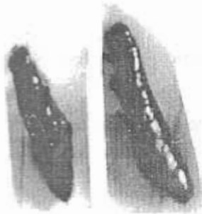
(Fig. 3,4) larval-pupal monstrosity with larval cuticle patches and pupal abdomen.