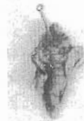
(Fig. 6) malformed adults had abnormal body and wings.