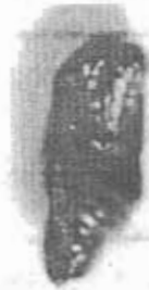
(Fig. 5) or undersized pupae showing body shrinkage.