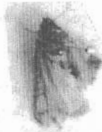
(Fig. 9) moths with deformed twisted wings.