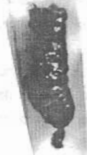
(Fig.8) or pupae failed to cast the old cuticle .