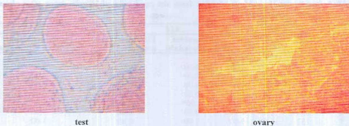
Fig. 1. Acetocarmine squash preparation from tests and ovary of fry Oreochromis aureus treated with 17- \beta ethynylestradiol

phenotypic females with normal male usually produce 100% male offspring, but slight deviations have been observed (Hopkins, 1979, Mair et al. , 1987, Lahav, 1993, Rosenstein and Hulata, 1994).