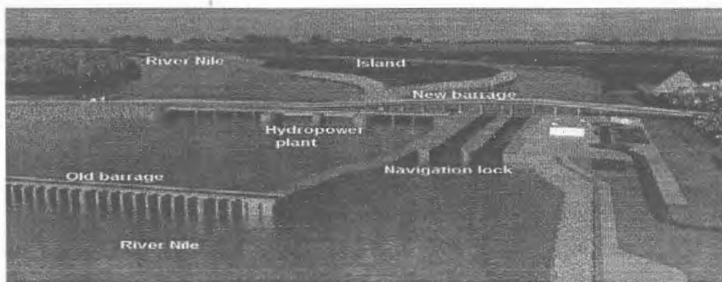
Figure (1): The proposed project of New Assiut Barrage and its Hydropower plant

A major impact on surface water quality may stem from biological processes such as bacterial contamination due to the release of water from wastewater treatment plants and diffuse run-off. Also, in particular conditions, sediment contamination may contribute to the persistence of contamination in the overlying water (Mananda et al. , 2010). Water turbidity can be increased by high plankton and algal concentrations and there may be a proliferation of mosquitoes and other insects leading to the risk of spreading malaria. Thus the study now focuses to identify impacts on river water quality regarding physicochemical and biological characteristics making a comparative analysis with future studies of the Environmental Impact Assessment of the project. Figure (1) illustrates the proposed project.