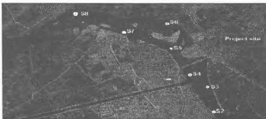
Figure (3): A map showing the project site and water sample locations

Global Position System (GPS) device (Garmin 62s) was used to define the coordinates of these sites as shown in Table (2).