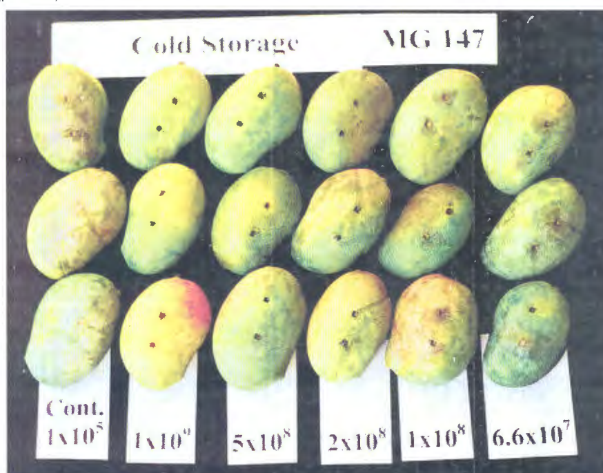
Photo 2. Development of Lasiodiplodia rot in wounded mango fruit treated with different concentrations of washed yeast cells of the best tested isolate and challenged with conidia of L. theobromae , then stored at 16±1°C for 14 days.

(6) Means followed by the same letter are not significantly different according to Duncan's multiple range test (p = 0.05).