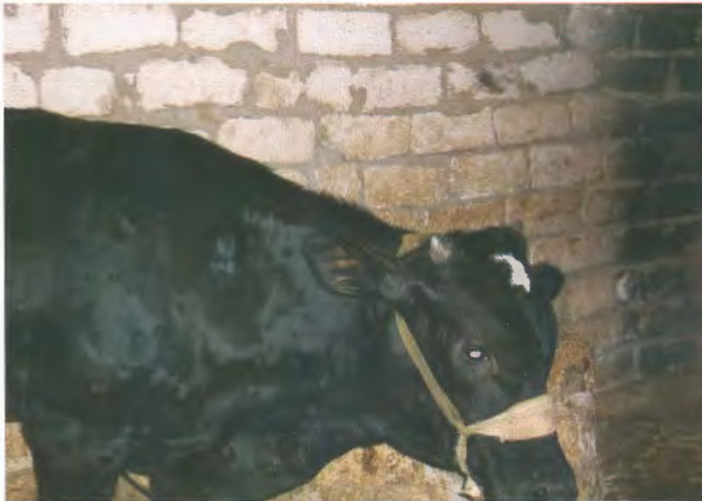
Figure 1: Appearance of multiple intradermal skin nodules

Signs in this group were milder than in non-vaccinated group as the temperature reaction is about (39.5-40 °C) and appearance of few intradermal skin nodules.