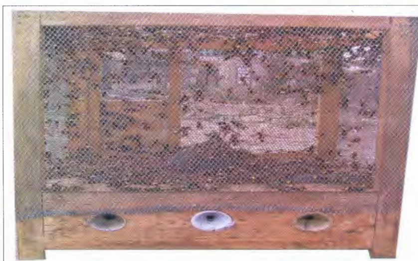
Fig. 3: Wasp trap used in the study.