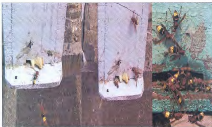
Fig.2: The oriental hornet attacks the mating nucleus

The obtained results also indicate that the oriental wasps prefer the Italian queens than the Carniolan queens and that results goes on the line with Yousif –Khalil et al. (2000) and El-Refaay (2010) who indicated that some colors had more attraction to the oriental wasps than others. Khodairy and Awad (2013) add to that oriental wasps V. orientalis use antennal chemo-receptors to detect the hosts during its active seasons. Bacandritsos et al. (2006) also demonstrated that V. orientalis is one of the most important insect pests affecting honey bee industry in Egypt.