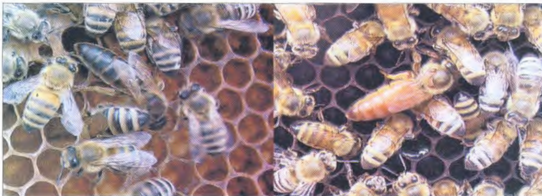
Fig.1: Virgin queens used in the study. left Apis mellifera carnica right Apis mellifera ligustica .

Queens returned from the mating flight and begin to lay eggs were counted for each race (group) and numbers were recorded.