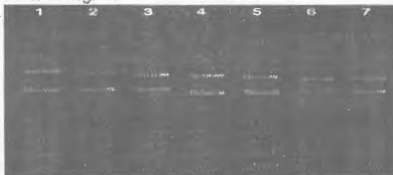
Fig. 1 The total extracted RNA of the tested rice genotype, nondegraded bands (large RNA molecules) and smeared bands (different small/large). Lanes 1-7 are for the rice genotypes Sakha101, Sakha104, Giza177, Sakha102, Giza178, Egyptian Yasmine and 08FAN6 respectively.

Total RNA was extracted from the roots of rice plants using the Simply P total RNA extraction kit (BioFlux, China), according to the manufacturer's instructions. The total RNA was extracted from each rice genotype roots after nine days of germination. The quality and integrity of the extracted RNA were assessed (as a nondegraded band) using 1.5% agarose gel. RNA purity (A260/280 ratio was determined) and the concentration was measured by spectrophotometer. RNA concentration was adjusted to 100 ng/ \mu l and stored at -80°C. Total extracted RNA of the tested rice genotypes is shown in Fig. 1.