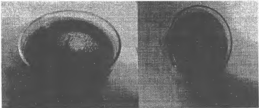
Fig (1): Inhibition of F. oxysporum on pomegranate peel extract at 30% concentration

In the present investigation, the antifungal effect of Pomegranate, Neem and Garlic extracts (Table 1) was studied on three fungi and the following results were obtained: For aqueous extracts in the pathogenic fungi cultures showed some variations. High antifungal effect was recorded on 20 and 30% pomegranate extract concentration against Fusarium oxysporum Fig (1) followed by 10% Neem.