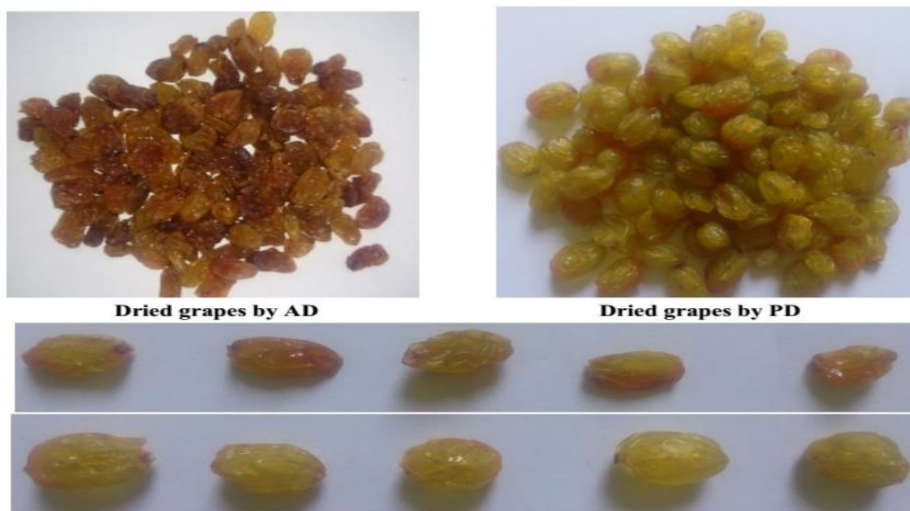
Fig. 3. Effect of convection air drying compared to puff drying method on the color of dried seedless grapes.