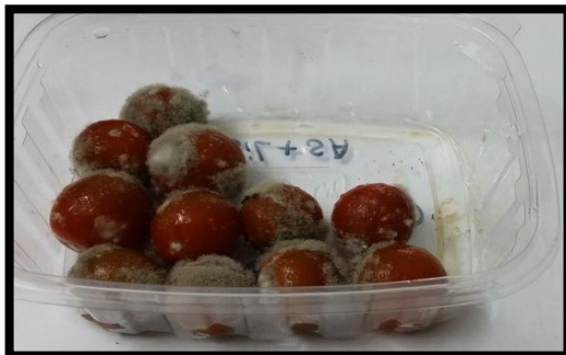
After 20 days of inoculation by A. alternata

(Zero time) (After 20 days of storage) appearance senescence Exhibited