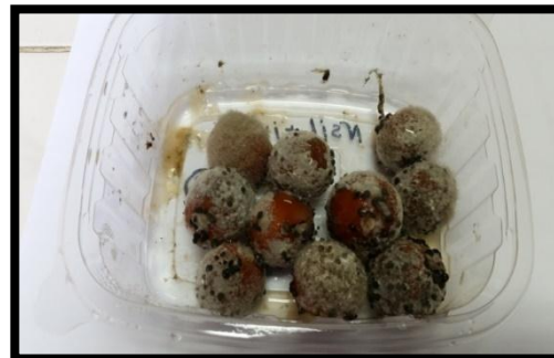
After 20 days of inoculation by B. cinerea