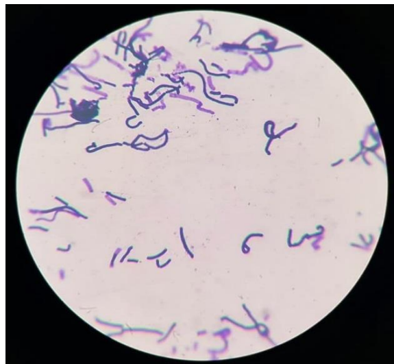
Fig. 3: Arrangement of Actinomyces spp. by Gram's stain showing Gram-positive filamentous rods (100x)