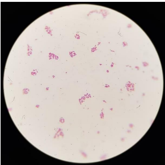
Fig. 2: Arrangement of Corynebacterium spp. by Gram's stain showing Gram-positive non-spore forming pleomorphic bacilli (100x) (V-shaped, L-shaped, palisade and Chinese letter).