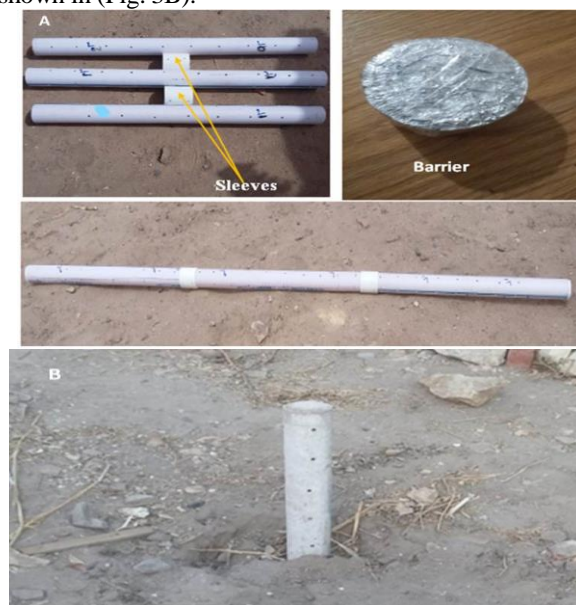
Fig. 3. A) Cylindrical column trap parts; B) Cylindrical column trap position

saturation. The column trap was buried in a vertical position to the depth of 230 cm into a hole with the aid of an auger on October 1 st , 2018 then was covered with soil as shown in (Fig. 3B).