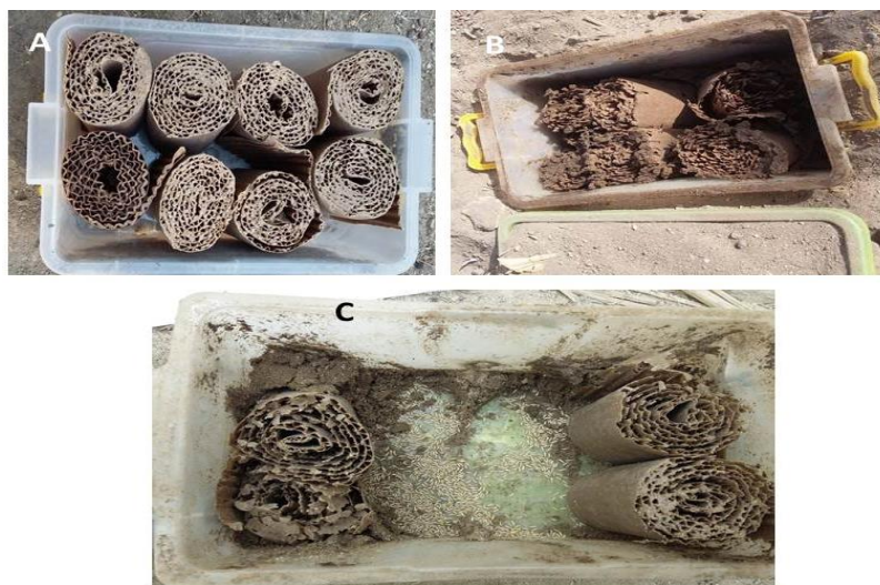
Fig. 2. A) Plastic box trap; B) Trap position; C) Infested trap contents.

workers and termite individuals (Fig. 2C) were put separately in plastic bags. Plastic traps were provided with the same baits and held back in the soil at the same position (Abd El-Latif, 2013). Plastic bags were transferred to the laboratory for examination to determine the percentage of traps visited by the termite species; count and classify the captured termite individuals into different castes (workers, soldier and alates); later, collecting soil particles and cardboard rolls remnants separately and drying them at 105 C° for 24 h in an electric oven, and weighed. Obtained dry weight of soil particles represented translocated soil by termite (Collins and Nutting, 1973 and Abd El-Latif, 2003 & 2013). Dry weight of cardboard rolls before burring the trap into the soil after removing dry weight of cardboard remnants represented food consumption (La Fage et al. , 1973; Brain, 1978; El-Sebay, 1991 and Abd El-Latif and Solaiman, 2014).