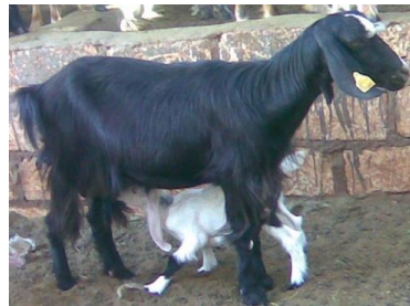
E. Baladi Goats